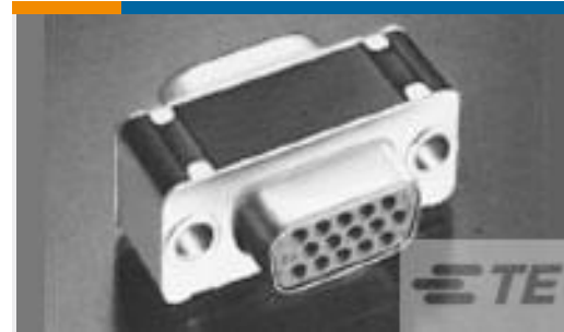
TE Part # 212560-2 CONN SAVER, 15 POSN, AMPLIMITE