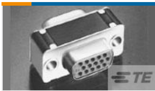
TE Part # 212561-2 CONN SAVER, SZ 3, AMPLIMITE