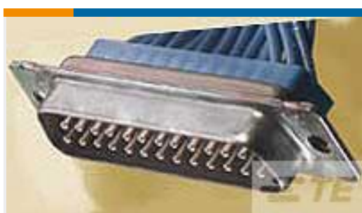
TE Part # 448815-1 AMPLIMITE, ASY, PLUG, 109, NM, CS, 1