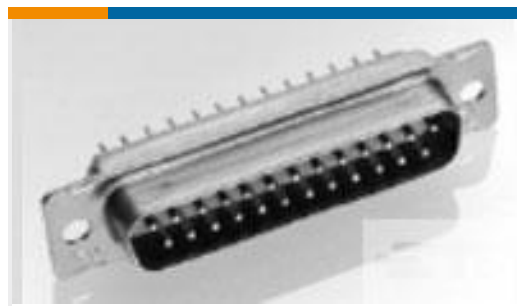
TE Part # 206801-2 AMPLIMITE RECEPT ASY, 25 POS