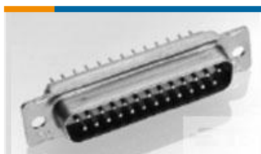
TE Part # 448816-2 AMPLIMITE, ASY, RCPT, 109, NM, CS, 2