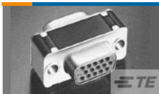
TE Part # 212562-2 AMPLIMITE CONN SVR, 37 POS, TRW