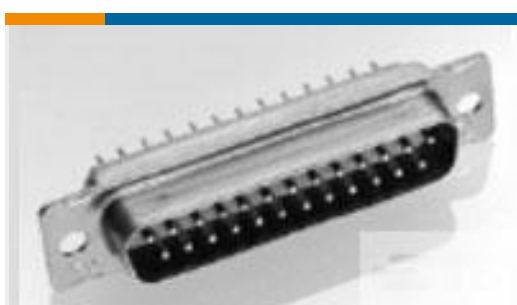
TE Part # 206803-1 AMPLIMITE RECEPT ASY, 37 POS,