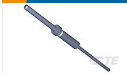
TE Part # 1-212565-0 AMPLIMITE, PIN CONT, SZ 20, AU PLTD