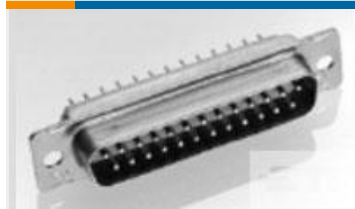
TE Part # 206802-1 PLUG ASSY, 37 POSN, AMPLIMITE